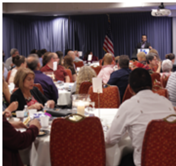
Client & Family Educational Dinner

Check out highlights from some of the events below: