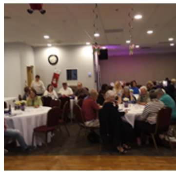
Client & Family Educational Lunch