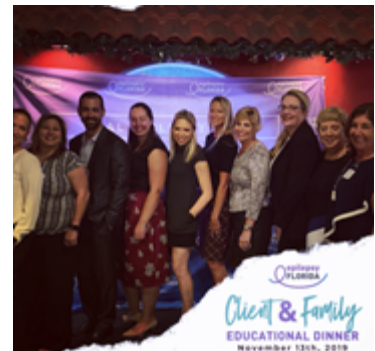
Client & Family Educational Dinner