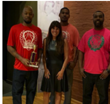
Keto & Vino Happy Hour