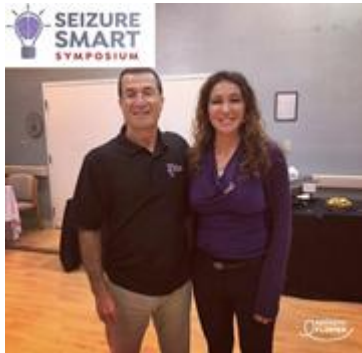
Seizure Smart Symposium