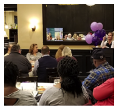
Client & Family Educational Dinner